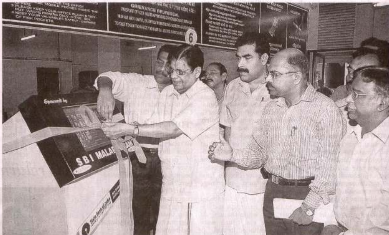
AT YOUR FINGERTIPS: Union Minister of State for External Affairs E. Ahamed inaugurating a touchscreen information kiosk at the Malappuram Passport Office on Friday.

The Union Minister praised Passport Officer M. Muraleedharan for expedit-